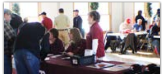
Mid-County staff greeting guests at our last annual meeting.

As always, I appreciate your comments to improve your coop.