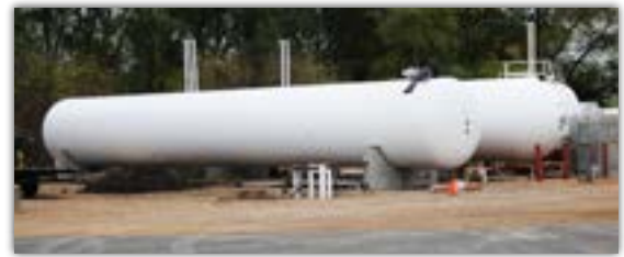
Mid-County Energy's new propane storage tank.

We also need a modern facility that can load product quickly. Most importantly is our commitment to our local farmers that there will be a local facility that can deliver on a timely basis.