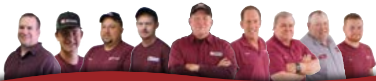
The Mid-County Agronomy Team

Mid-County's plans to update its fertilizer plant was a big dream that will soon become a reality. The new facility will bring the 45 year old facility up to date and be state of the art. Instead of taking several minutes to process a batch of fertilizer it will only take a few seconds and it will be extremely accurate.