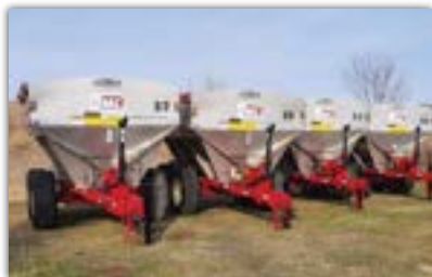
Fertilizer spreaders, part of Mid-County's fleet of ag equipment.

Recapping the reasons for building a new plant are speed of loading, less labor to operate, and more storage space. With the speed that crops are planted, and the uncertainty of the fertilizer supply chain, we needed more storage. There are too many variables with rivers or trains to ensure a reliable supply of fertilizer when you need it.