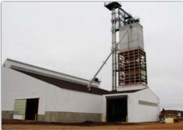
Mid-County's new fertilizer plant.

In our spring newsletter, we talked about tearing down the old fertilizer plant right after the planting season. Initially we had some challenges receiving our state and local permits which left us a few weeks behind, but once we had the permitting resolved, the project moved along steadily all summer. As I am writing this, we are filling up the new building and blending loads for customers.